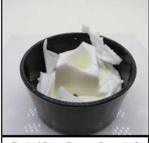
End of Burn Front - Sample 2