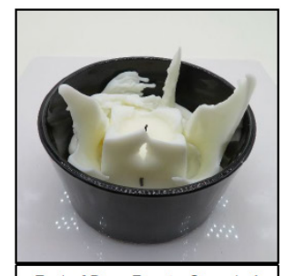
End of Burn Front - Sample 1