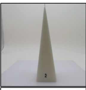
Before Burn Front - Sample 2