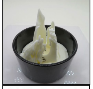
End of Burn Front - Sample 3