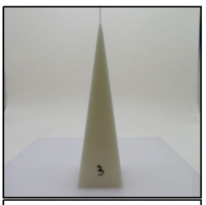
Before Burn Front - Sample 3