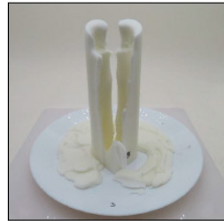
After Burn - Sample 3