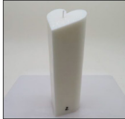
Before Burn - Sample 2