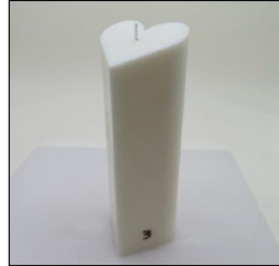
Before Burn - Sample 3