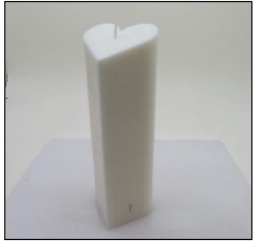
Before Burn - Sample 1