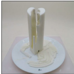
After Burn - Sample 2