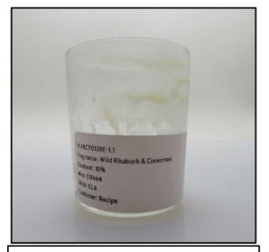
End of Burn Front - Sample 1