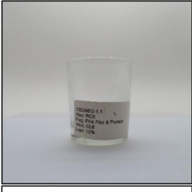
End of Burn Front - Sample 1