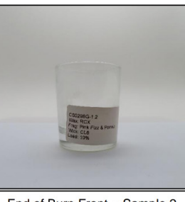
End of Burn Front - Sample 2