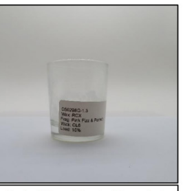
End of Burn Front - Sample 3