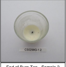
End of Burn Top - Sample 2