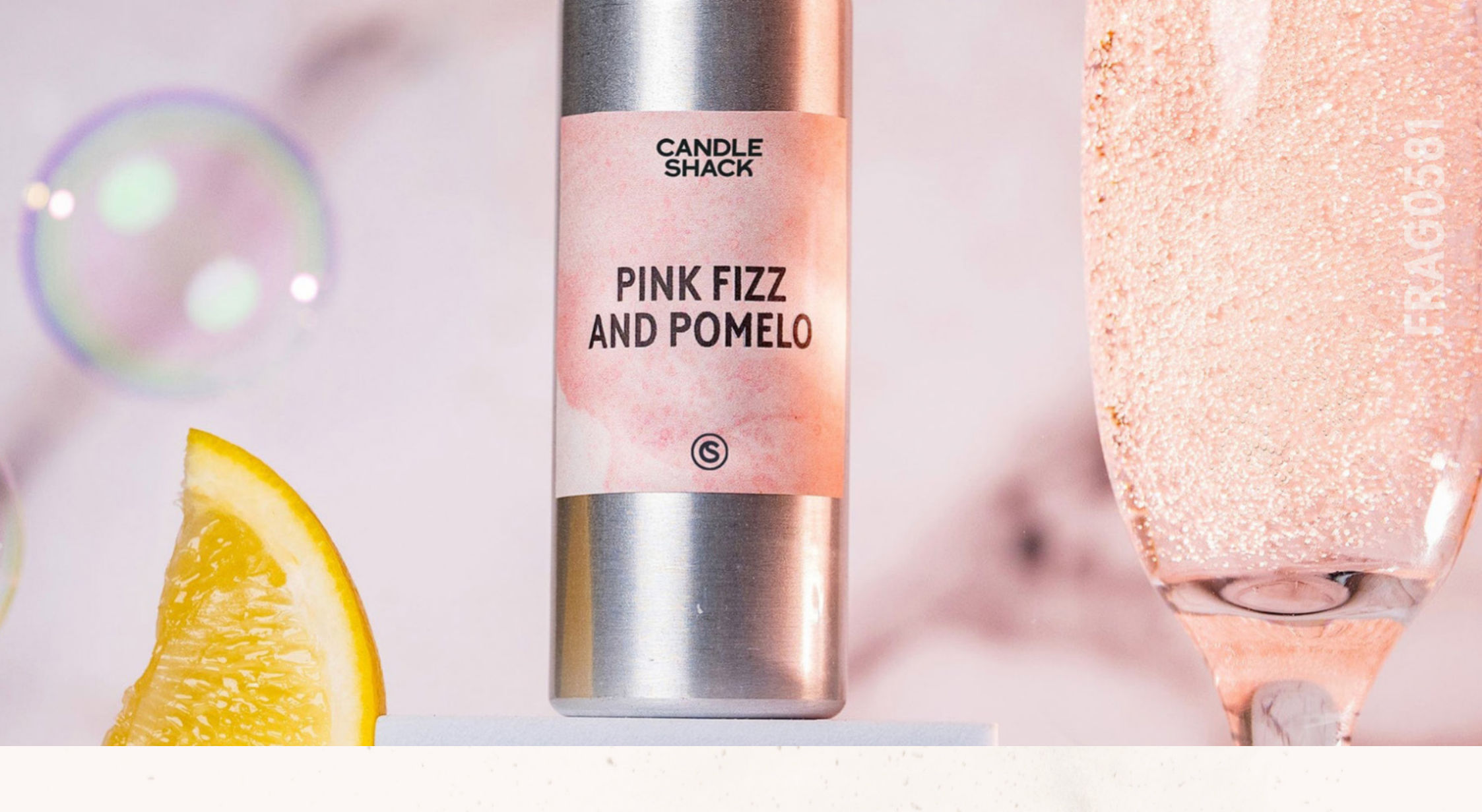
RECIPE - 9CL PINK FIZZ AND POMELO IN RCX