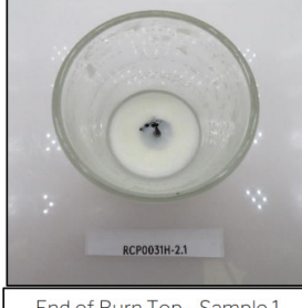
End of Burn Top - Sample 1