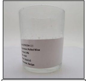
End of Burn Front - Sample 1