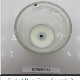
End of Burn Top - Sample 2