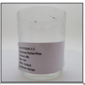
End of Burn Front - Sample 2