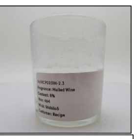
End of Burn Front - Sample 3