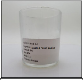
End of Burn Front - Sample 1