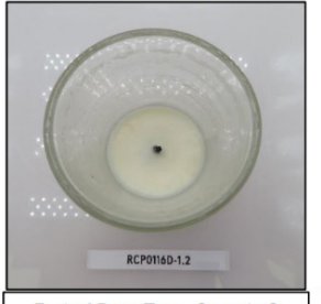
End of Burn Top - Sample 2