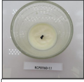
End of Burn Top - Sample 1