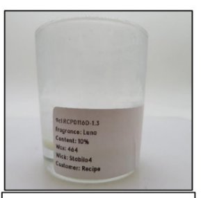
End of Burn Front - Sample 3