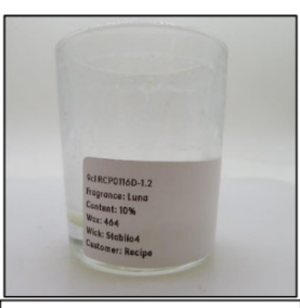
End of Burn Front - Sample 2