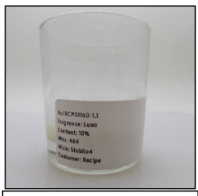
End of Burn Front - Sample 1