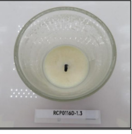
End of Burn Top - Sample 3