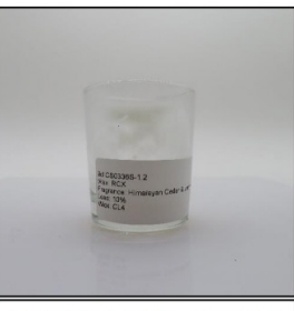
End of Burn Front - Sample 2