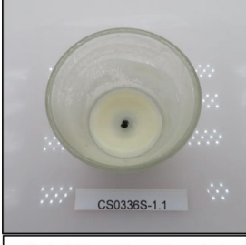
End of Burn Top - Sample 1