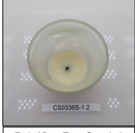
End of Burn Top - Sample 2