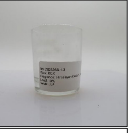
End of Burn Front - Sample 3