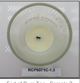
End of Burn Top - Sample 3