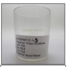
End of Burn Front - Sample 3