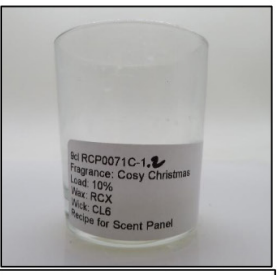
End of Burn Front - Sample 2