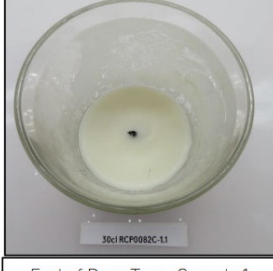
End of Burn Top - Sample 1