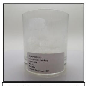
End of Burn Front - Sample 3