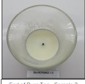
End of Burn Top - Sample 3