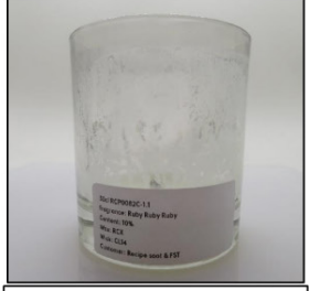
End of Burn Front - Sample 1