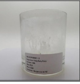
End of Burn Front - Sample 2