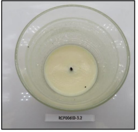
End of Burn Top - Sample 2