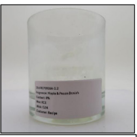
End of Burn Front - Sample 2