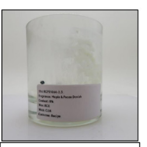
End of Burn Front - Sample 3