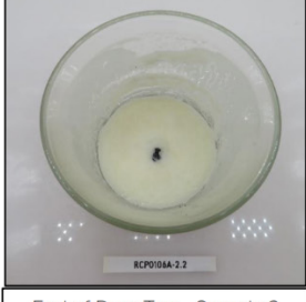
End of Burn Top - Sample 2