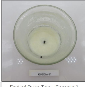
End of Burn Top - Sample 1