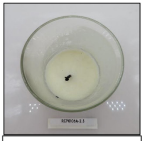
End of Burn Top - Sample 3