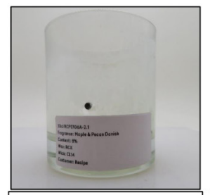
End of Burn Front - Sample 1