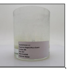
End of Burn Front - Sample 3