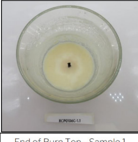
End of Burn Top - Sample 1