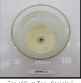
End of Burn Top - Sample 2