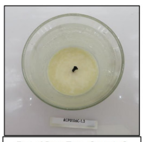
End of Burn Top - Sample 3