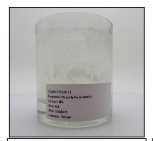
End of Burn Front - Sample 1