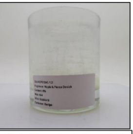
End of Burn Front - Sample 2