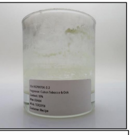
End of Burn Front - Sample 2