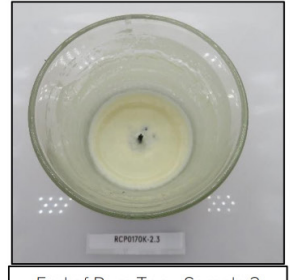
End of Burn Top - Sample 3