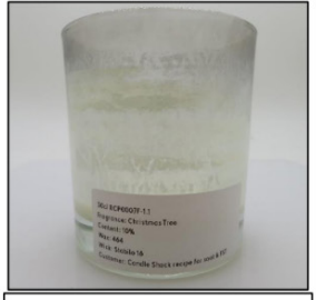
End of Burn Front - Sample 1