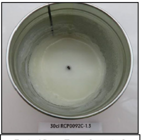
End of Burn Top - Sample 3