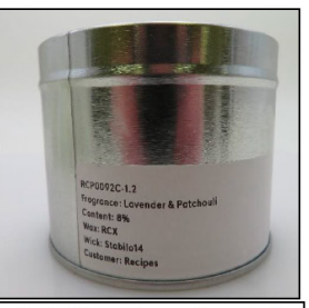
End of Burn Front - Sample 2