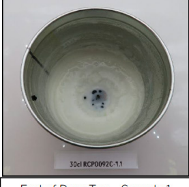
End of Burn Top - Sample 1