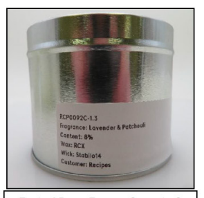
End of Burn Front - Sample 3