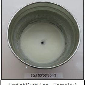
End of Burn Top - Sample 2