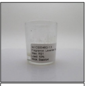
End of Burn Front- Sample 3