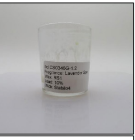
End of Burn Front- Sample 2