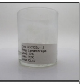
End of Burn Front- Sample 3