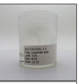
End of Burn Front- Sample 2