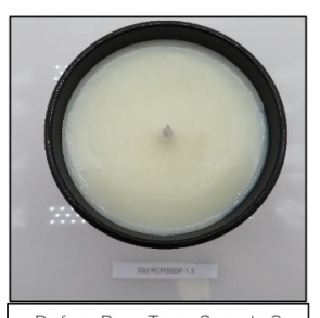
Before Burn Top - Sample 3