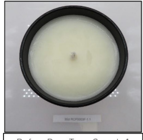
Before Burn Top - Sample 1