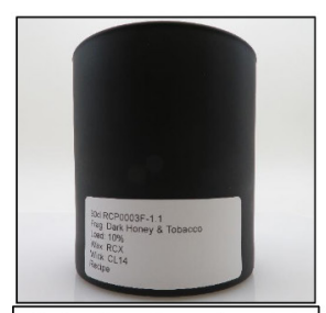
Before Burn Front - Sample 1