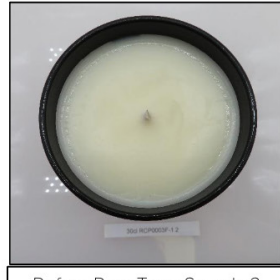
Before Burn Top - Sample 2