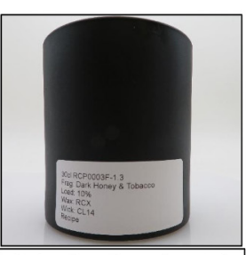
Before Burn Front - Sample 3