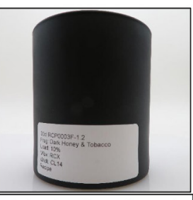
Before Burn Front - Sample 2