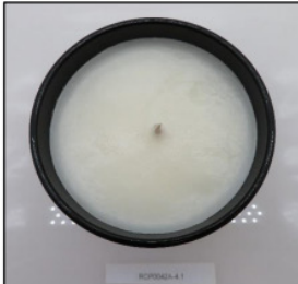
Before Burn Top - Sample 1