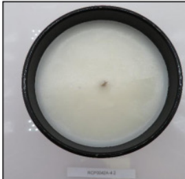
Before Burn Top - Sample 2