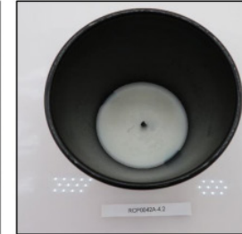
End of Burn Top - Sample 2