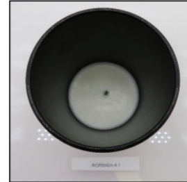
End of Burn Top - Sample 1