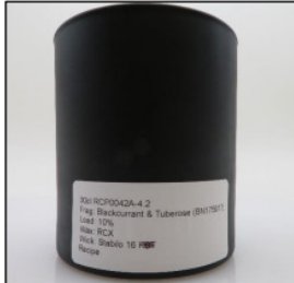
Before Burn Front - Sample 2