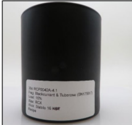
Before Burn Front - Sample 1