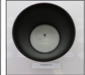
End of Burn Top - Sample 3