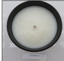
Before Burn Top - Sample 3