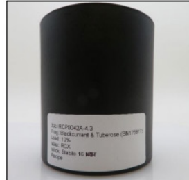
Before Burn Front - Sample 3