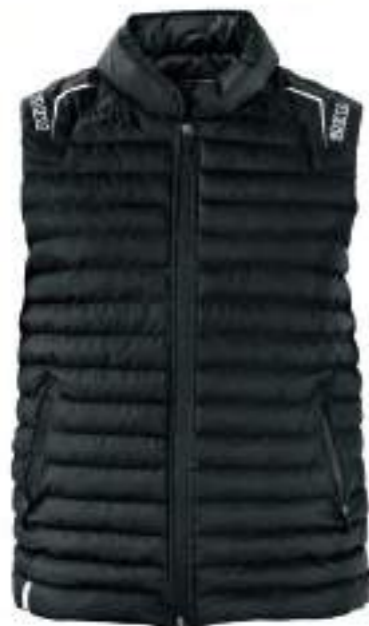
01259NR.. (while stocks last)