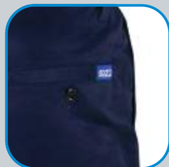
Sparco embroidery on right pocket.