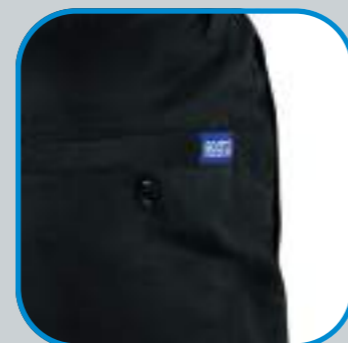
Sparco embroidery on right pocket.