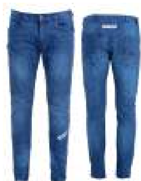
02409DE.. (while stocks last)