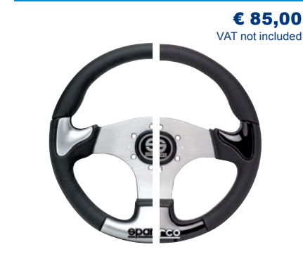
MONZA L550 3 R.CALICE