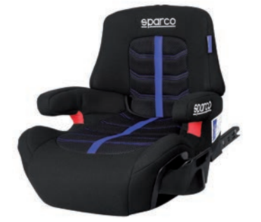
SIZE: 6 - 12 Years