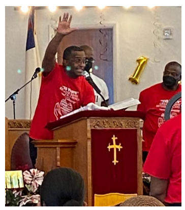
July 10 Guest Preacher for Greater Israel Bethel 110th Church Anniversary in Miami, FL