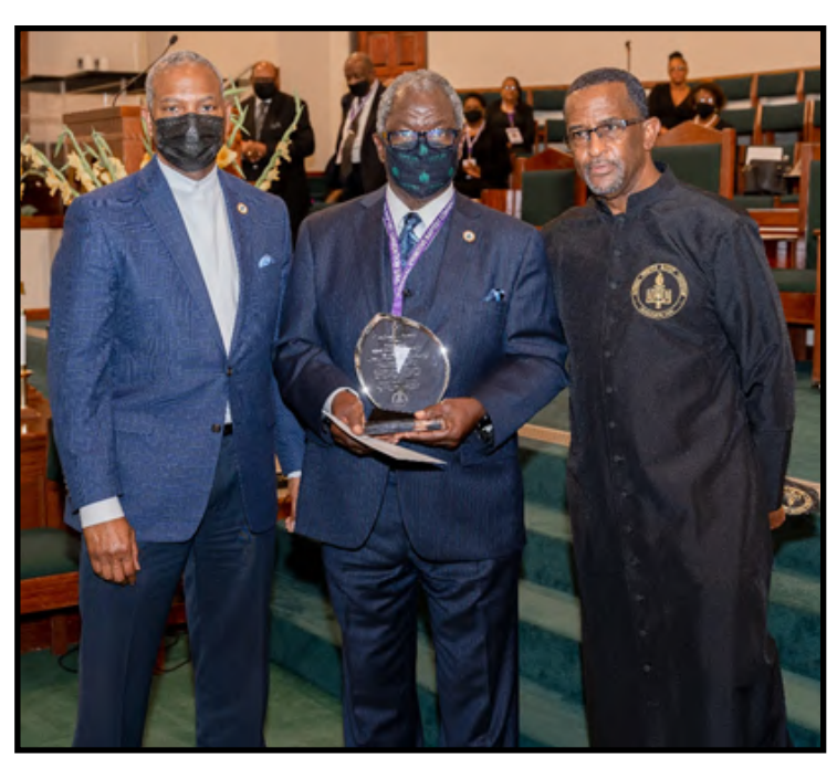
CANDLESTICK AWARD Union Hill Primitive Baptist Church