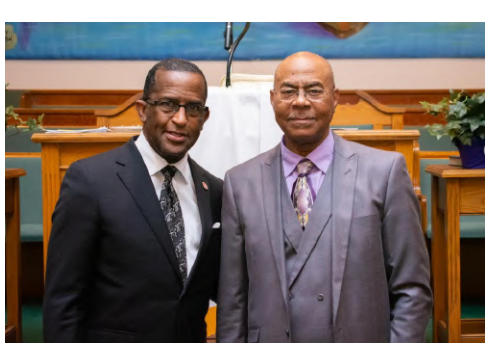
May 28-29 Attended the Southern Regional Conference held at Crumbey Bethel in Birmingham, AL