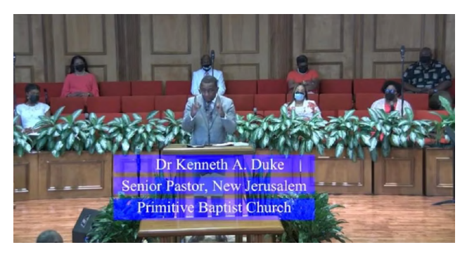
June 5 Guest Preacher for for Prayer and Consecration Service at Zion Hope Pensacola, FL