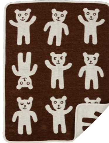
BRUNO by KARIN MANNERSTÅL 70 X 90 CM. 100 % ORGANIC COTTON CHENILLE 2502-13 Brown