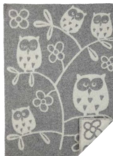
TREE OWL by BITTE STENSTRÖM 65 X 90 CM. 100 % ECO LAMBSWOOL 2422-01 Light grey