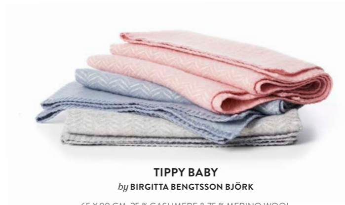
TIPPY BABY by BIRGITTA BENGSSON BJÖRK 65 X 90 CM. 25 % CASHMERE & 75 % MERINO WOOL 2313-02 Pink | -03 Blue | -01 Grey