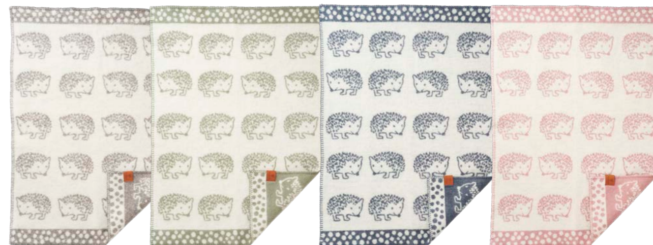
HEDGEHOG by BITTE STENSTRÖM 65 X 90 CM. 50 % RECYCLED WOOL & 50 % ECO LAMBSWOOL 2465-01 Grey | -02 Green | -03 Blue | -04 Pink