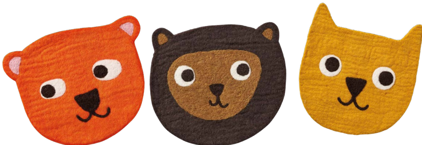
ART DIRECTION & STYLING: GABRIELLA AGNÉR / LILLA GUBBEN & PERNILLA ROOS

KLIPPAN YLLEFABRIK AB | PO. BOX 3 | 264 21 KLIPPAN | SWEDEN | PHONE: +46 435-44 88 80 | FAX: +46 435-44 88 88 | info@klippanyllefabrik.se | www.klippanyllefabrik.se