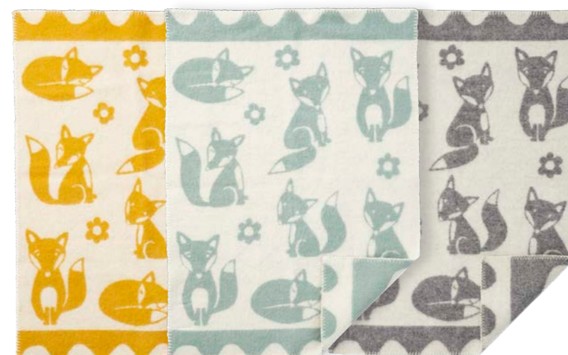
FOX by BITTE STENSTRÖM 65 X 90 CM. 100 % ECO LAMBSWOOL 2450-01 Saffron | -02 Duck egg blue | -03 Grey