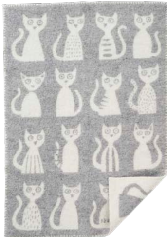
CAT by BENGT & LOTTA 65 X 90 CM. 100 % ECO LAMBSWOOL 2463-03 Grey