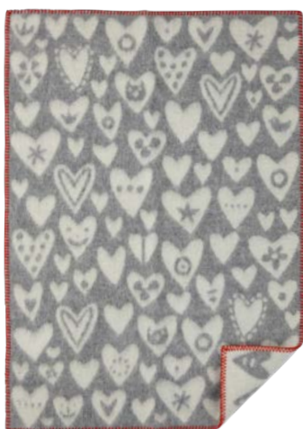
BABY HEART by BENGT & LOTTA 65 X 90 CM. 100 % ECO LAMBSWOOL 2408-01 Grey