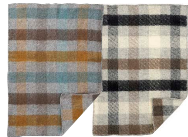
GOTLAND BABY 65 X 90 CM. 25 % GOTLAND WOOL & 75 % ECO LAMBSWOOL 2311-03 Multi turquoise | -01 Multi grey