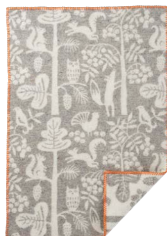
TREE CLIMBERS by BENGT & LOTTA 65 X 90 CM. 50 % RECYCLED WOOL & 50 % ECO LAMBSWOOL 2461-02 Grey