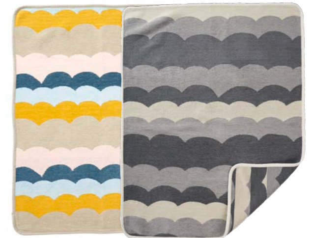
HILLS by TINA BACKMAN 70 X 90 CM. 100 % ORGANIC COTTON CHENILLE 2569-01 Multi | -02 Grey