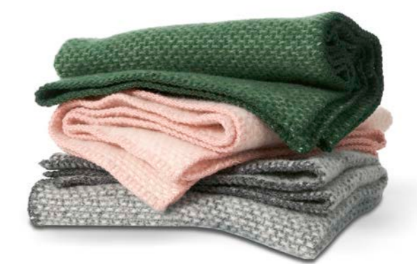
DOMINO BABY 65 X 90 CM. 100 % ECO LAMBSWOOL 2304-02 Green | -04 Pink | -01 Dark grey