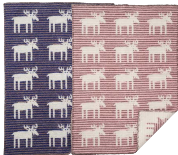
MOOSE STRIPE BABY by BENGT & LOTTA 65 X 90 CM. 100 % ECO LAMBSWOOL 2468-01 Blue | -02 Pink