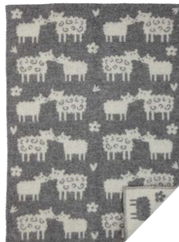
BÄÄ by BENGT & LOTTA 65 X 90 CM. 100 % ECO LAMBSWOOL 2424-01 Grey