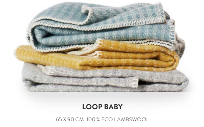
LOOP BABY 65 X 90 CM. 100 % ECO LAMBSWOOL 2315-02 Sky blue | -03 Mustard | -01 Stone