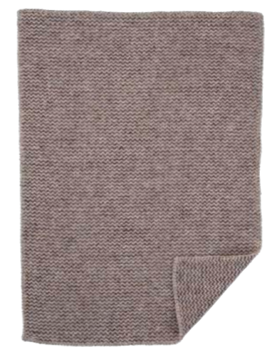
WAVE BABY 65 X 90 CM. 50 % RECYCLED WOOL & 50 % ECO LAMBSWOOL 2310-01 Natural brown