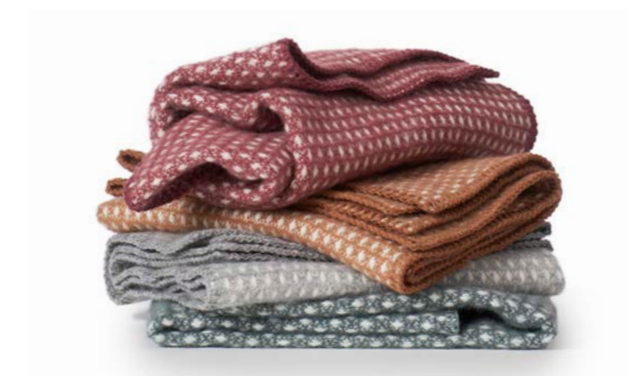
KNUT BABY 65 X 90 CM. 100 % ECO LAMBSWOOL 2316-04 Rose brown | -02 Nougat | -01 Light grey | -03 Balsam green