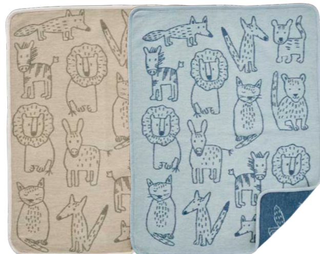
BUDDIES by BITTE STENSTRÖM 70 X 90 CM. 100 % ORGANIC COTTON CHENILLE 2568-01 Khaki | -02 Blue