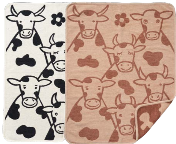
MUU by BITTE STENSTRÖM 70 X 90 CM. 100 % ORGANIC COTTON CHENILLE 2573-01 Black/white | -02 Beige/brown