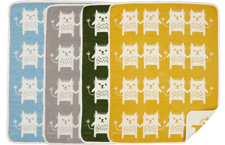
LITTLE ME by EDHOLM ULLENIUS 70 X 90 CM. 100 % ORGANIC COTTON CHENILLE 2538-04 Turquoise | -03 Grey | -02 Green | -01 Yellow