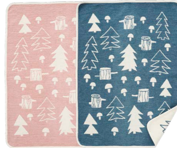
MUSHROOM by TINA BACKMAN 70 X 90 CM. 100 % ORGANIC COTTON CHENILLE 2567-02 Pink | -03 Blue