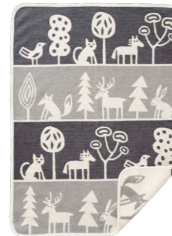
WILDLIFE by BENGT & LOTTA 70 X 90 CM. 100 % ORGANIC COTTON CHENILLE 2572-01 Grey | -02 Green | -03 Blue