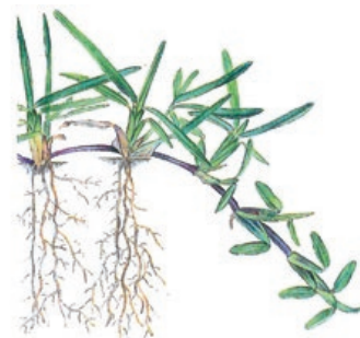
Fig 1. Stolon and leaf structure illustration.