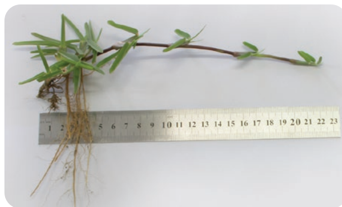
Fig 3. Close-up of live stolon.

For further information or advice contact us on (07) 3114 8281 or visit jimboombaturf.com.au