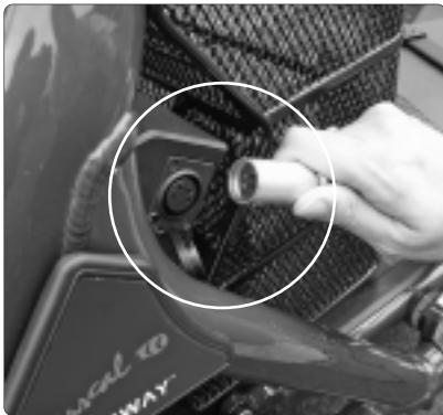
Charging Point (on rear chassis)