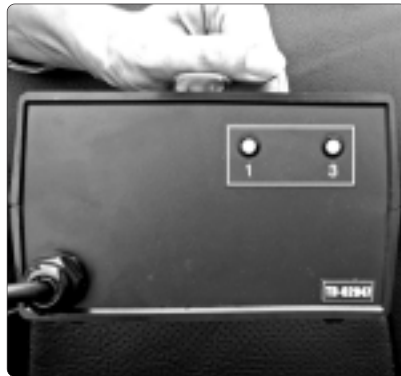
Liteway 6 Charger