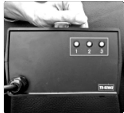
Liteway 8 Charger

The charging socket is located on the side of the battery box. Remove the protective cover and push in the round silver plug. When the vehicle is charged remove the plug, and refit the protective cover to keep the water out. The battery charger has two or three small lamps depending on the number of batteries. When the charger is connected and switched on each lamp will show reddish orange. When each battery is charged the lamp will change to green. Ensure that all lamps show green before disconnecting