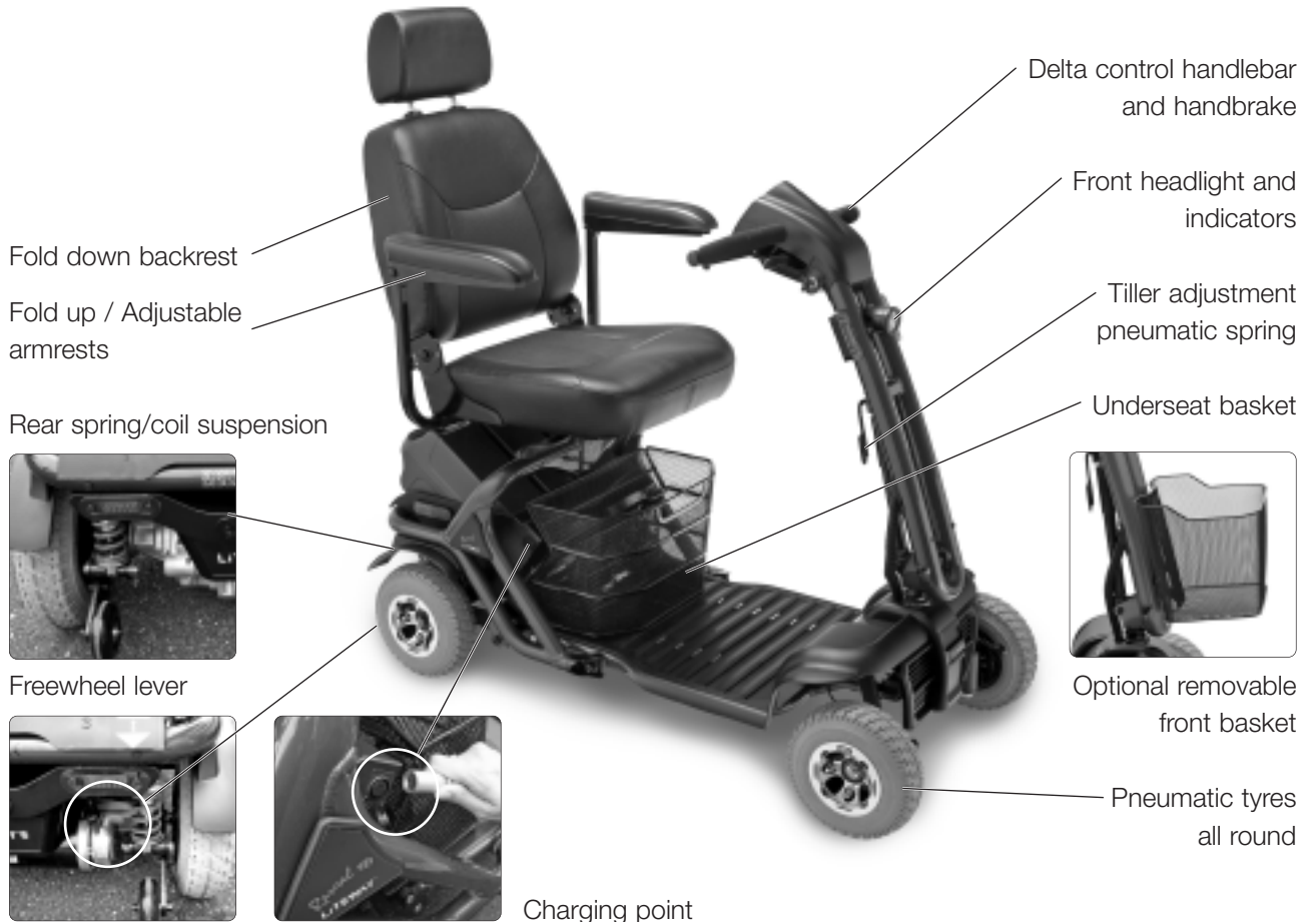
Photo shows Liteway 8 model scooter. The Liteway 6 is similar – see specification for differences.