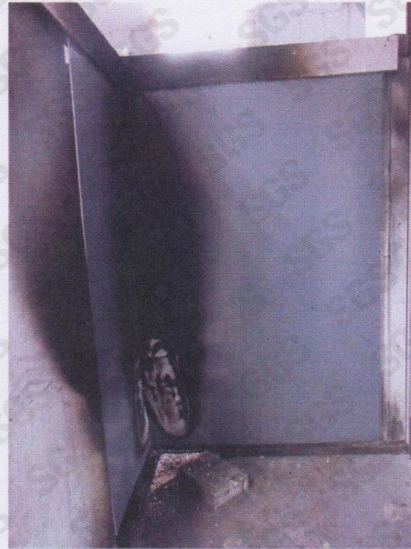
After Test (EN 13823)