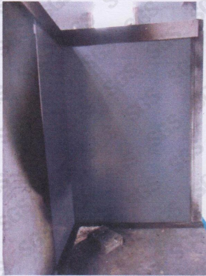
Before Test (EN 13823)