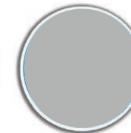
Whisper Grey Metallic