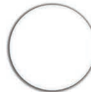
Sheer Bliss White