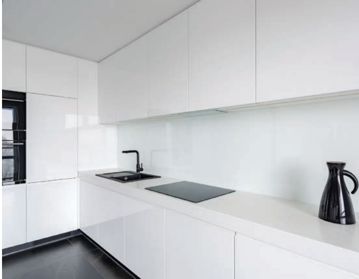
Sheer Bliss White

Reflections offers extra flexibility thanks to its ability to fold and bend to follow curves and corners therefore limiting joint lines for seamless finish. It can suit a variety of vertical applications and makes an outstanding statement in any room including kitchens, bathrooms, laundries and entertainment areas.