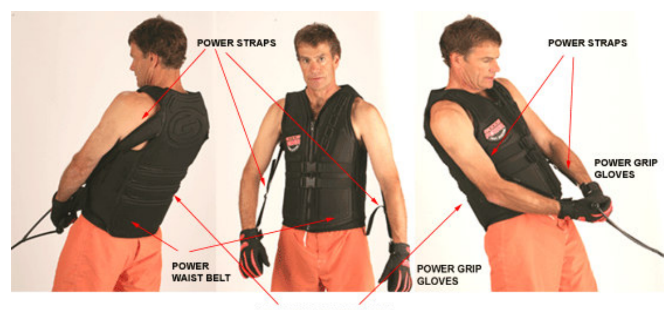
LOAD DISTRIBUTION PANEL

To transfer pressure to your ski, when using the PowerVest™ , the PowerGrip™ Gloves grasp the ski handle with an over center leverage strap device that is similarly used by Olympic