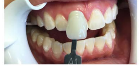
Start Shade: C3 End Shade: A1 Regimen: 2 8-min passes of 30% H 2 O 2 12 shades whiter!