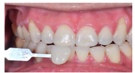
Tetracycline Case Start Shade: C4 End Shade: 1M1 Regimen: (2x) 4 8-min passes of 30% H 2 O 2 followed by 14 days TH whitening 16 shades whiter!