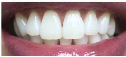
Start Shade: A1 End Shade: OM2 Regimen: 3 8-min passes of 24% H 2 O 2 5 shades whiter!