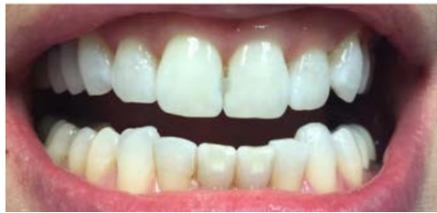
Start Shade: A2 End Shade: OM1 Regimen: 4 8-min passes of 24% H 2 O 2 8 shades whiter!