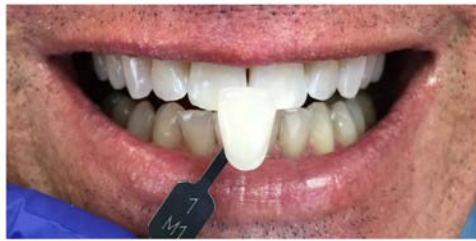
Start Shade: D2 End Shade: 1M1 Regimen: 4 8-min passes of 30% H 2 O 2 4 shades whiter!