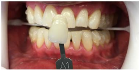
Start Shade: A3 End Shade: A1 Regimen: 4 8-min passes of 30% H 2 O 2 7 shades whiter!