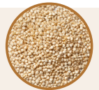
Vitamin B complex PANMOL®