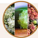
Organic native Australian superfood