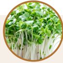
SIRTCELL™ Broccoli sprout Brassica oleracea