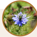
Organic Black cumin seed Nigella sativa