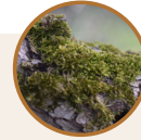
Vitashine™ Vegan D3