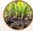
Activated vitamins and minerals