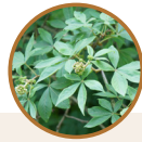
Organic Eleutherococcus senticosus