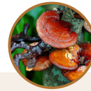
Reishi mushroom Ganoderma lucidum