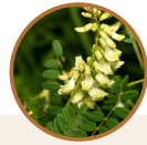
Organic Astragalus membranaceus