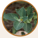
KSM-66® Organic Ashwagandha