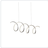
LP93742-AS Antique Silver