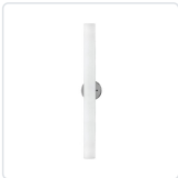
WS8332-BN Brushed Nickel