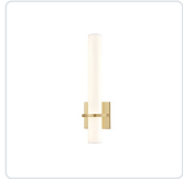
WS83218-BG Brushed Gold