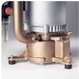
Redesigned intake manifold allows for smooth air flow and greater efficiency.