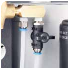
Quick connect hose connections allow for tool-free serviceability. Water recycler by-pass valve provides extra protection against water mineral deposits.