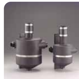
Air Water Separators

Air Water Separator/ Muffler for single and twin vacuums.