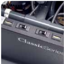
Separate twin model on/off switches and hour meters provide operational versatility.