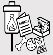
Pet Products for Sale (inside/outside)