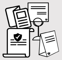
Co-Branded Marketing & Pet Policies