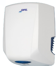
AA56000 8427950367342 White finish