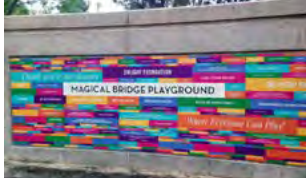
EXAMPLE OF UNIQUELY DESIGNED DONOR WALL