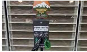
BRANDING ON OTHER ON-SITE ASSETS