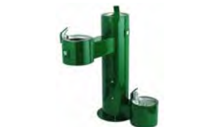
BRANDING ON OTHER ON-SITE ASSETS