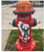
CUSTOM LOGO ON FIRE HYDRANT PAINTED BY ARTIST