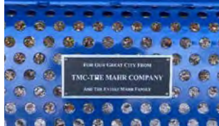
PLAQUE ON PARK BENCH EXAMPLE