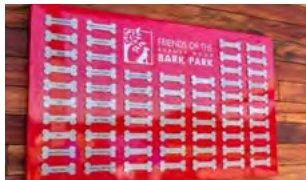
DOG DEDICATION WALL EXAMPLE