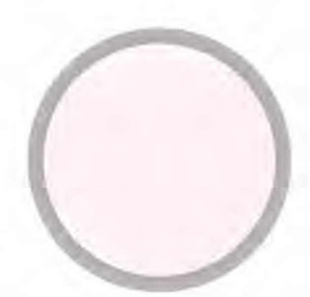
CRYSTAL PINK C PO1 CRY PINK (SEMI-CLEAR)

Pink Powders are available in an assortment of pink shades and opacities. Get creative with these pinks for pink and white nails, French applications, as a cover powder or to design your own color powder.