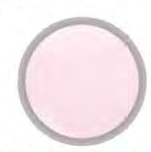
SHIMMER PINK KISS C PO1 SHM PI