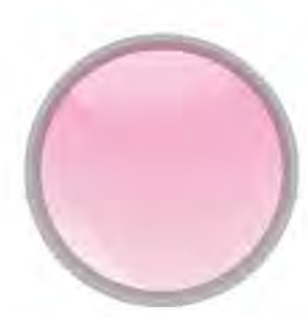
PINK #1 C PO1 PIN # 1