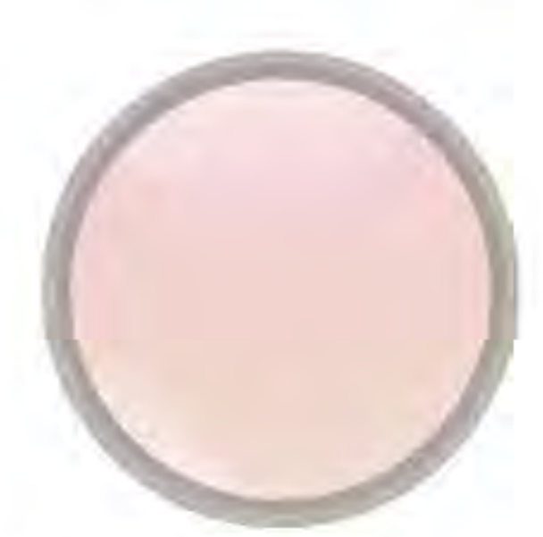
PINK #3 CANDY C PO1 PIN # 3