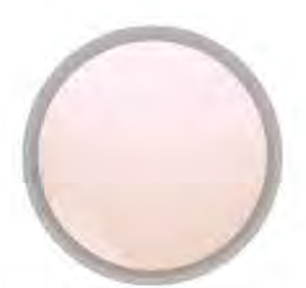
PINK #4 REGULAR C PO1 PIN # 4