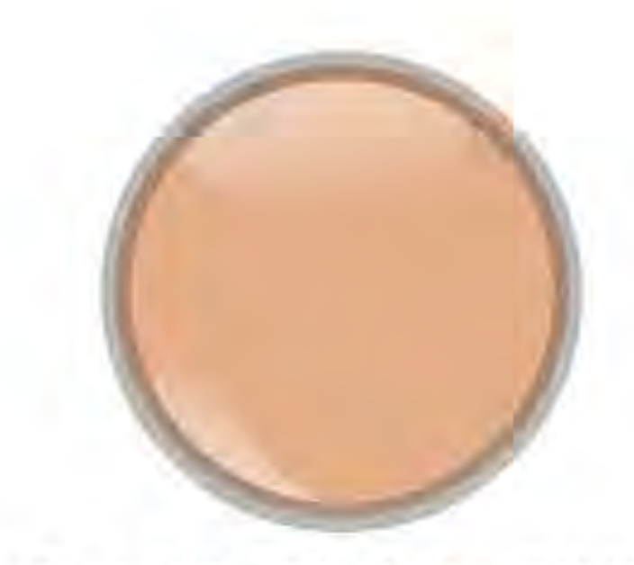
COVER BLUSH PINK C PO1 COV BP