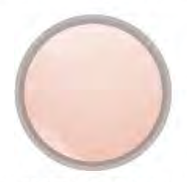
SHIMMER BUNNY WHITE SHIMMER PEACH KISS C PO1 SHM PE