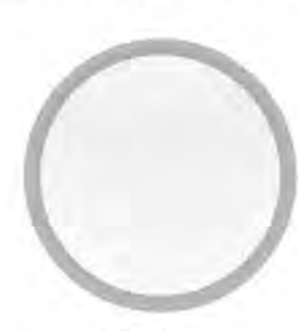
OMBRE #2 C PO1 OMB 02