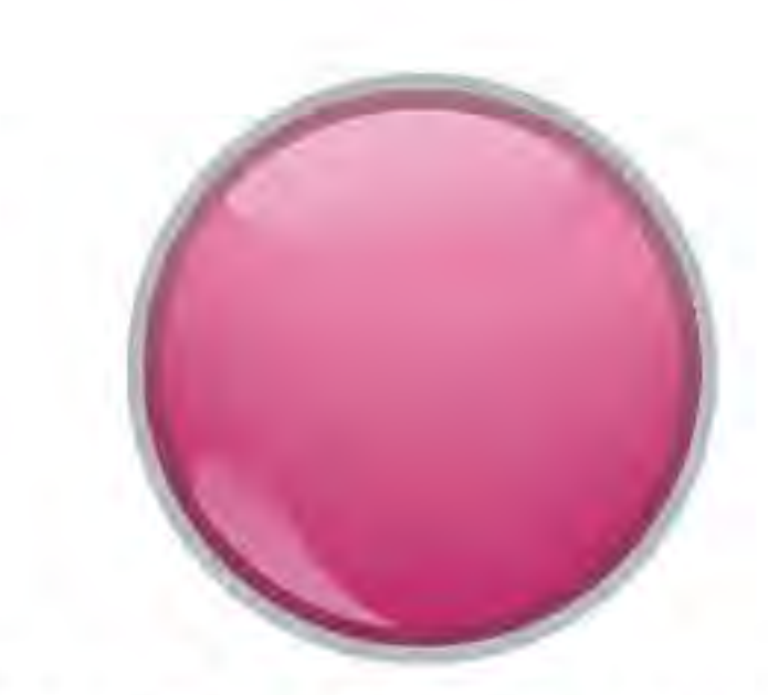
EXTRA DRAMATIC PINK - X3