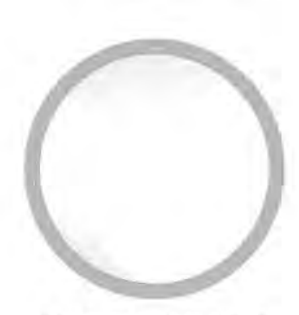
C PO1 WHI XS