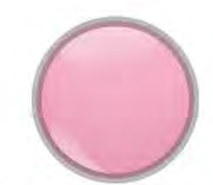
DRAMATIC PINK - X2 C PO1 PIN X2