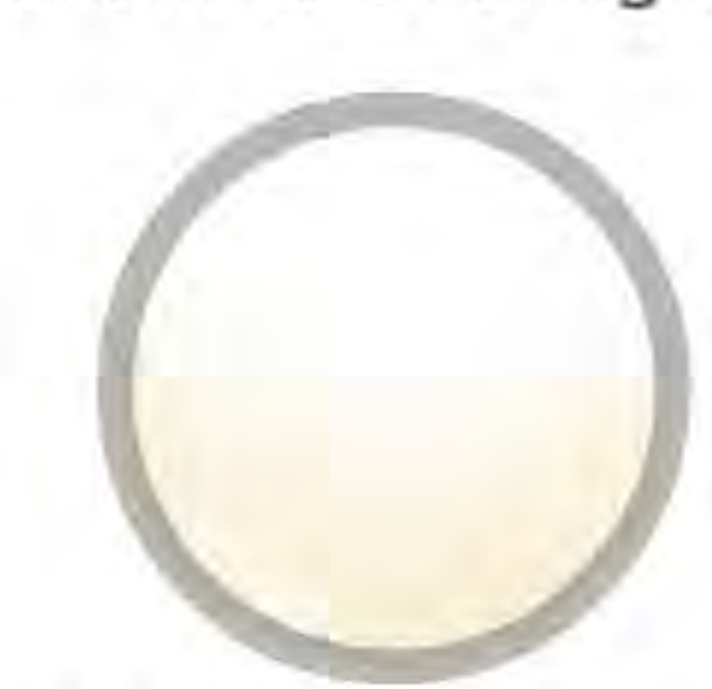
C PO1 SHM BW