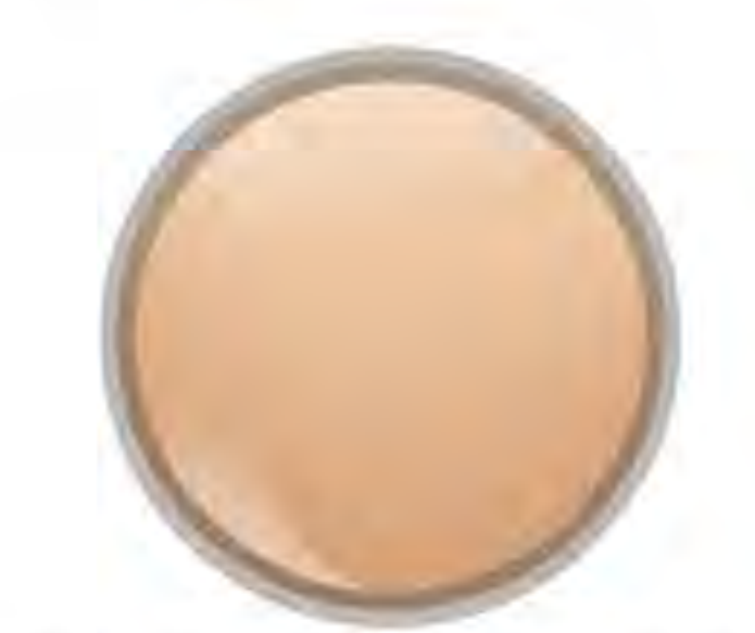
COVER WARM PINK C PO1 COV WP