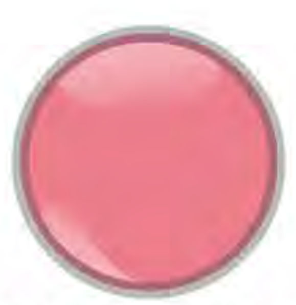
PIGMENT PINK C PO1 PIN XP