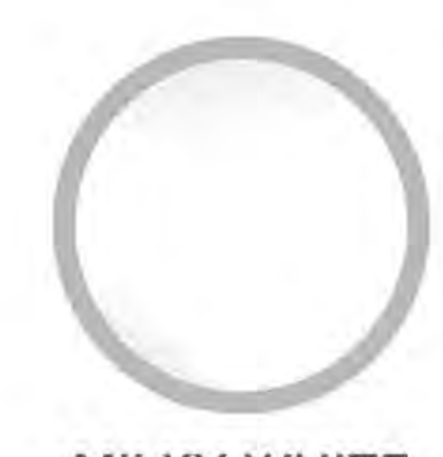
C PO1 WHI M1