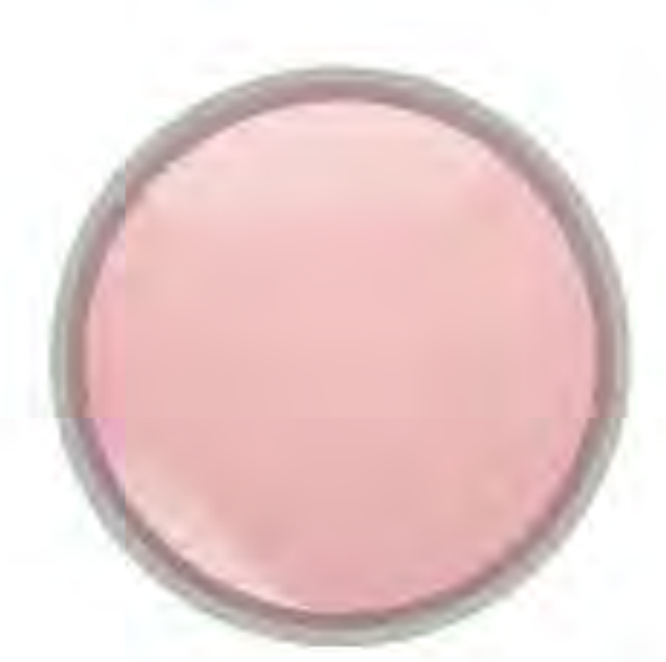
PINK #2 C PO1 PIN # 2