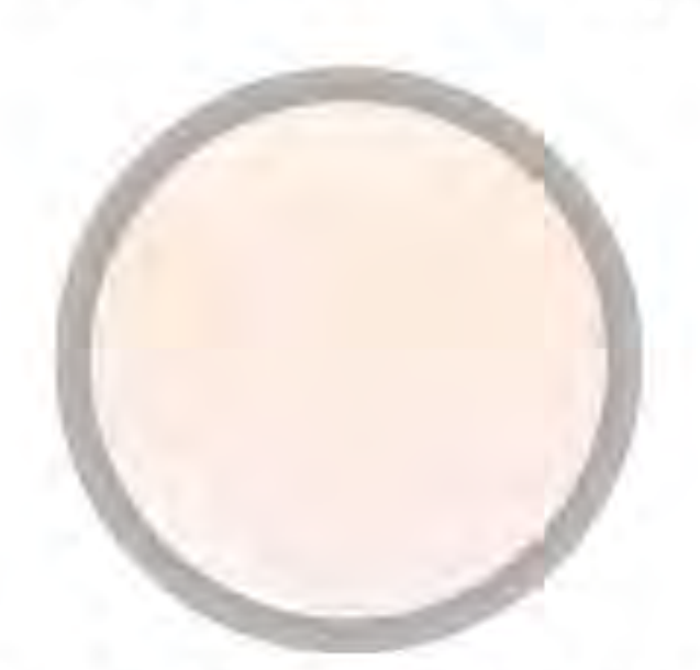
SHIMMER BABY PINK C PO1 SHM BP

Shimmer Powders use pearlescent mica to bring that extra luster to pink and white powders