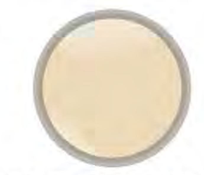
COVER PEACH KISS C PO1 COV PK