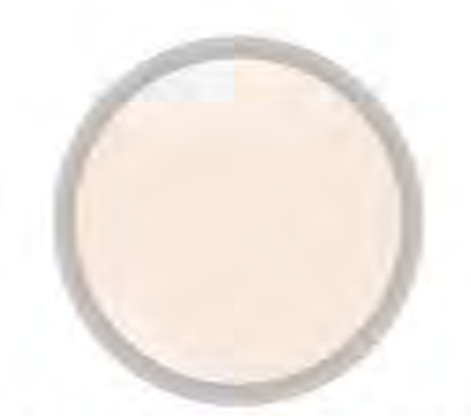
COVER COOL PINK C PO1 COV CP