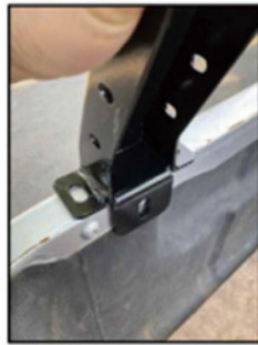
installed on the car side