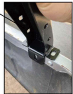
installed on the car side

It's easiest to assemble the basic structure on the ground. This tub rack's height is adjustable and can be altered once its on the vehicle. Installation can be easier done at a lower height and later altered to suit your requirements.