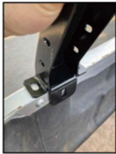
installed on the car side