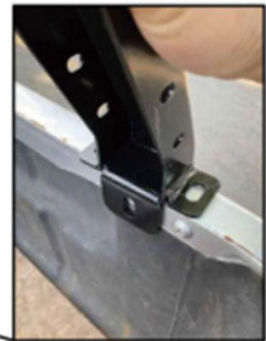
installed on the car side