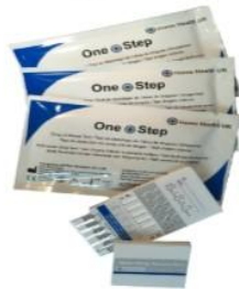
Fig.3 Multi-Drug Panel Test

Due to the sensitive nature of this drugs test, you must be careful when carrying out the test to avoid contamination and thus inaccurate test results. Please read these instructions carefully before beginning the test.