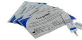
Fig.2 Single Drug Panel Test