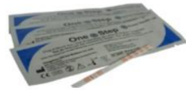
Fig.1 Single Drug Strip Test

One of the most common substances that causes false positives is Codeine , which is found in a variety of over-the-counter painkillers, including Nurofen Plus and Co-codamol. These products will give a positive result on an opiate / morphine test. It would be advisable to ask the person being tested if they are on any prescription drugs for medical purposes before the test is carried out.