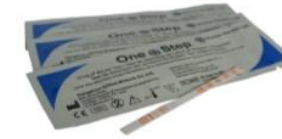
Fig.1 Single Drug Strip Test

This test is very accurate and the sensitivity levels meet the U.S.A. SAMHSA (Substance Abuse and Mental Health Services Administration) standards and recommended levels set by the National Institute on Drug Abuse (NIDA). There is however a possibility of false results due to the interference of other substances in the urine. One of the most common substances that causes false positives is Codeine , which is found in a variety of over-the-counter painkillers, including Nurofen Plus and Co-codamol. These products will give a positive result on an opiate / morphine test. It would be advisable to ask the person being tested if they are on any prescription drugs for medical purposes before the test is carried out.