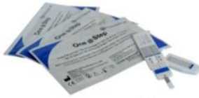
Fig.2 Single Drug Panel Test