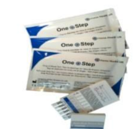
Fig.3 Multi-Drug Panel Test

Due to the sensitive nature of this drugs test, you must be careful when carrying out the test to avoid contamination and thus inaccurate test results. Please read these instructions carefully before beginning the test.