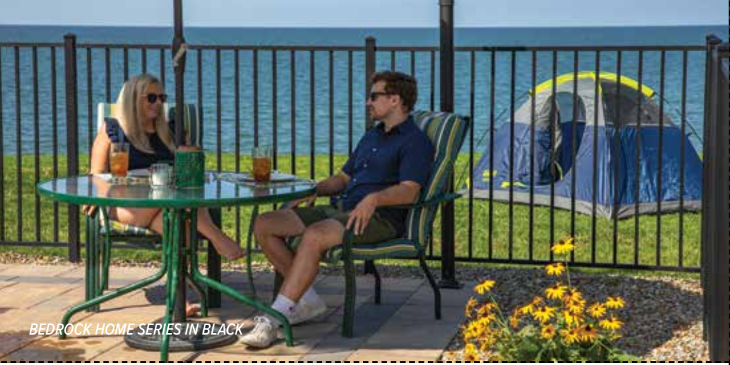
BEDROCK HOME SERIES IN BLACK