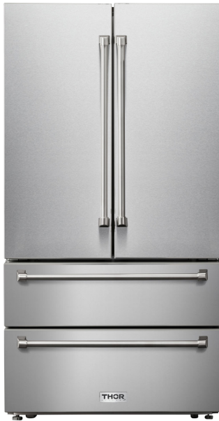
Product: 36" 4-Door Counter-Depth French Door Refrigerator With Ice Maker Model Number: TRF3602