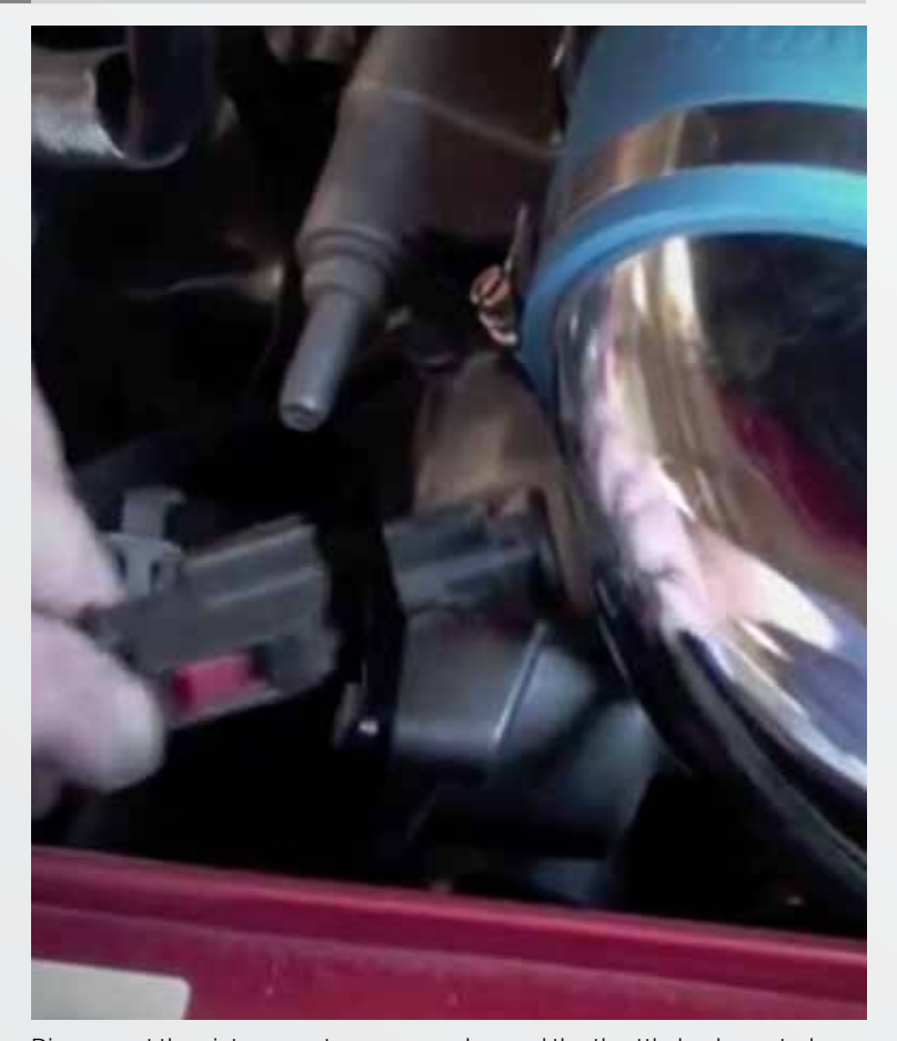
Disconnect the air temperature sensor plug and the throttle body control motor plug.