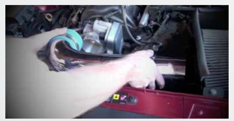
Re-install the air inlet tube to the BBK Throttle Body and air box and then tighten the clamps.