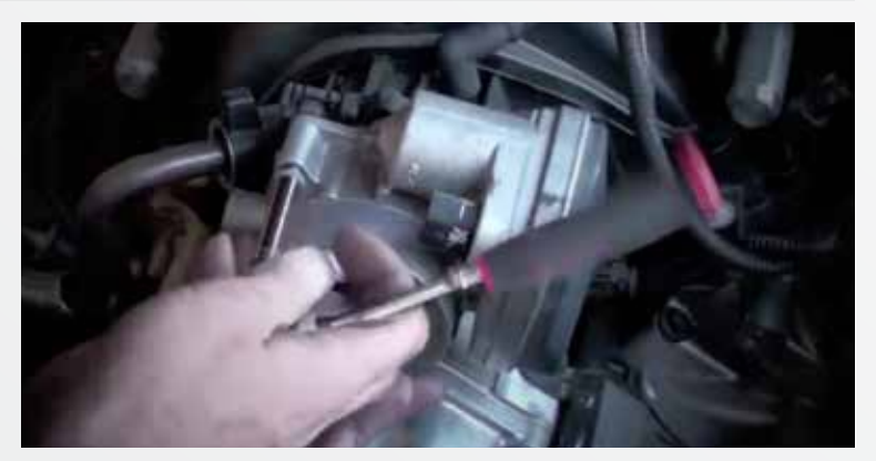
Bolt on the BBK Throttle Body using the stock hardware. On the 5.7L Hemi Plastic manifolds, take extra care when re-installing the mounting bolts. The "Speed Nut" type threaded nuts can be easily stripped. Make sure the threads of the bolts are properly engaged with the nut before tightening.