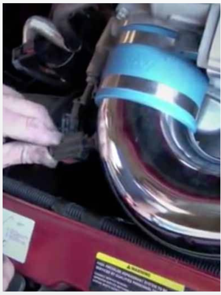
Re-connect the air temperature sensor and the throttle body control motor plug. Re-connect the negative battery terminal and refer to page 2 of the instruction sheet for throttle relearn procedure.