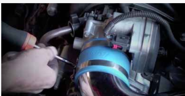
Loosen the clamps on the air intake tube and air box, and then remove the tube.