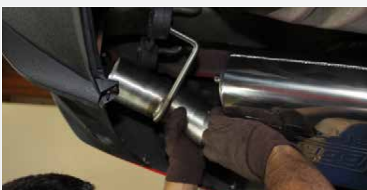
Slide the exit pipe onto the muffler and through the rear hanger grommets, then snug the clamp enough to still allow adjust-ability.