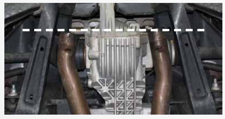
You will need to cut the mufflers from the vehicle using a hack saw or sawsall. Line up your cut with the end of the Rear Differential.