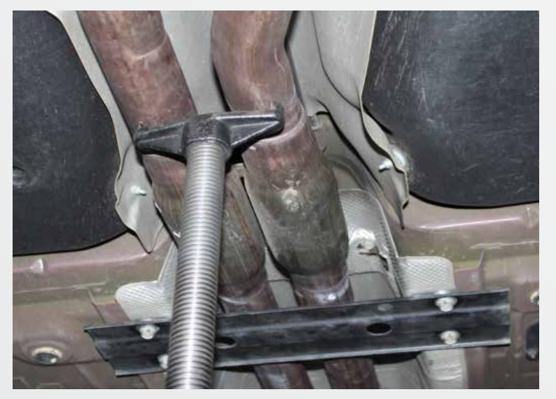
Place a stand underneath the mid pipes to keep them from drooping down.