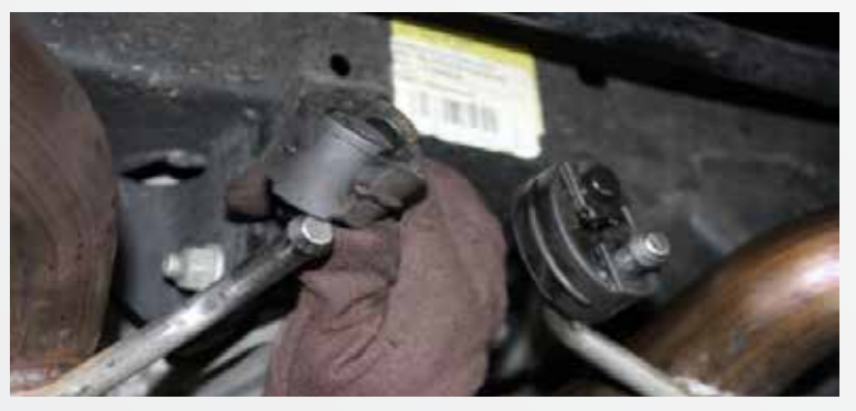
Remove the inner rubber grommets holding the muffler hangers.

NOTE!! Applying WD-40 will aid in removal.