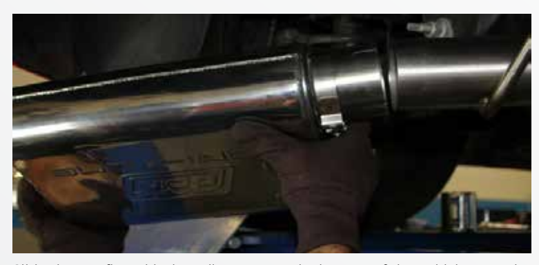
Slide the muffler with the adjuster towards the rear of the vehicle onto the inlet pipe and snug the clamp enough to still allow adjust-ability.