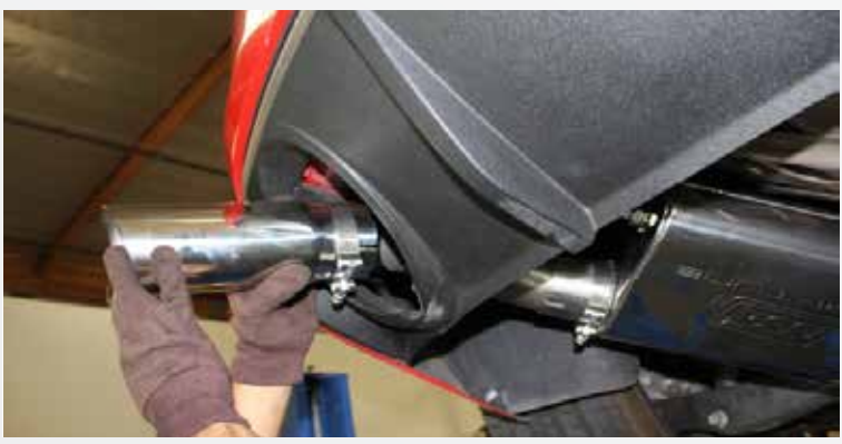
Slide the exhaust tip over the exit pipe and snug the clamp enough to still allow adjust-ability.