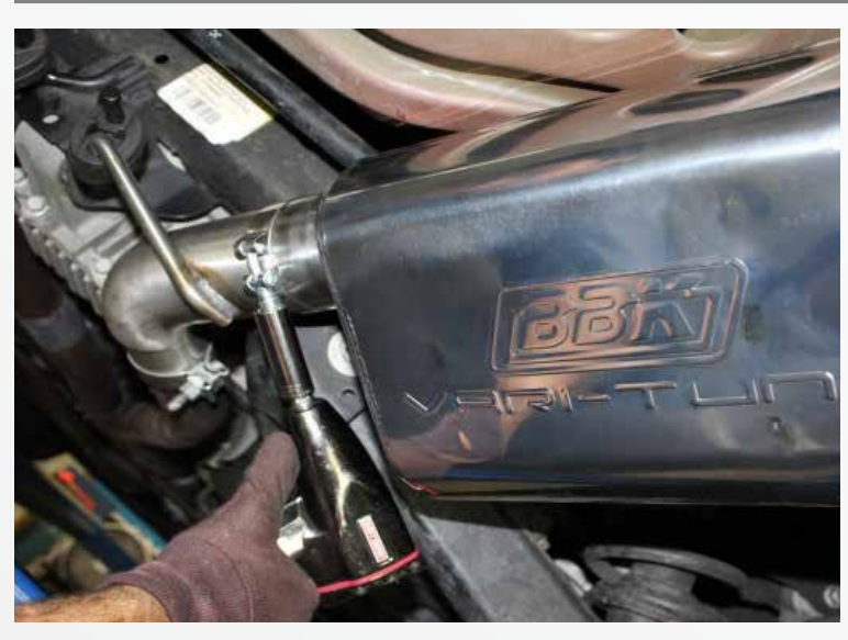
Starting at the inlet pipe clamp adjust the axle back system to your personal preference and tighten the clamps