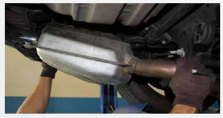
Slide the stock muffler towards the front of the vehicle and remove.