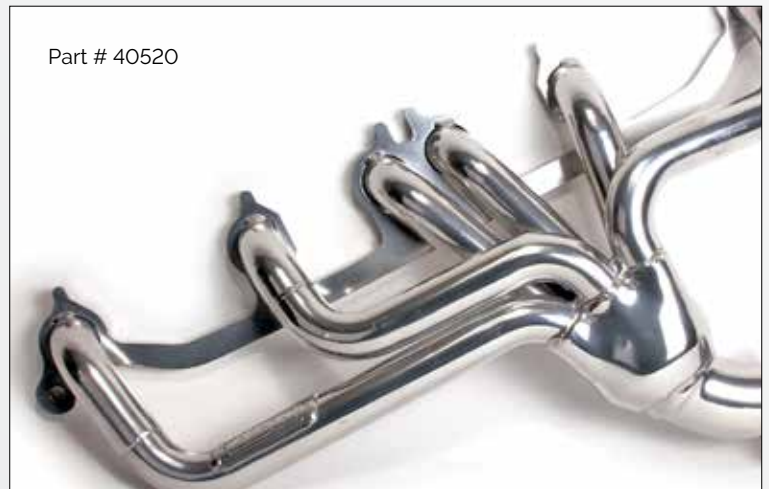
Part # 40520