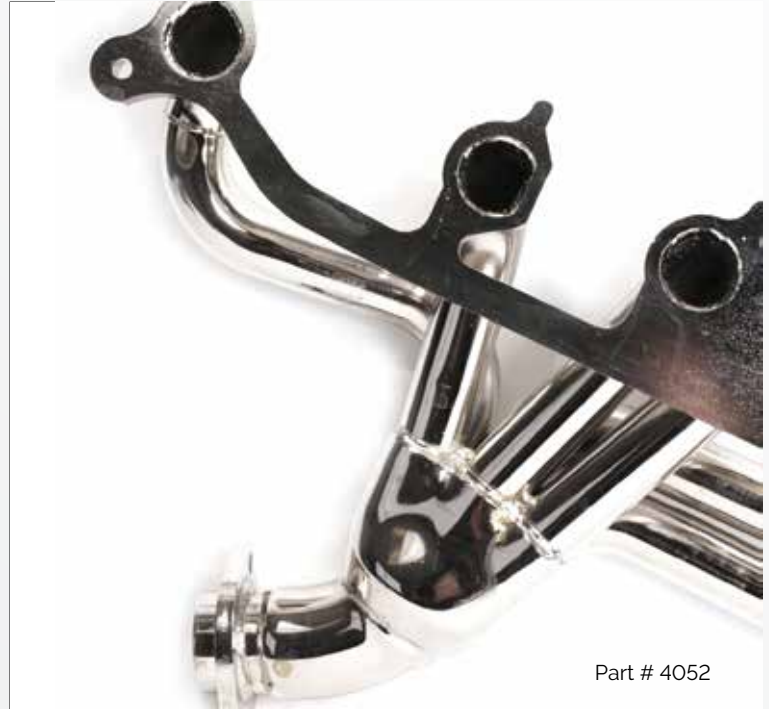
Part # 4052