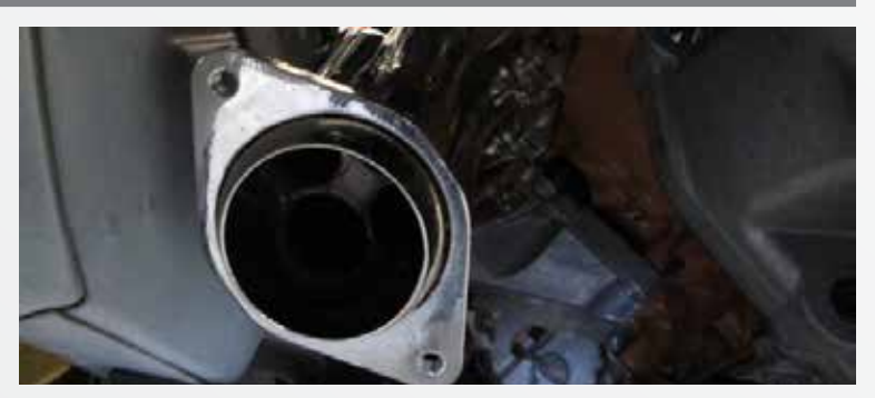
Install BBK headers using supplied hardware and gasket with 12mm socket/wrench. Re-install motor mount and steering shaft.