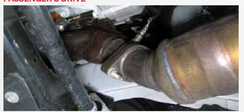
Repeat same as driver's side.