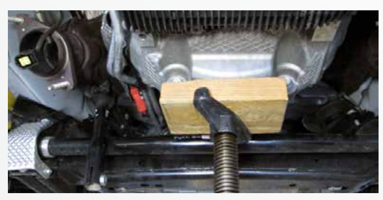
Safely support engine for removal and install motor mounts.