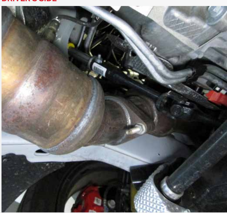
Disconnect O<sup>2</sup> sensor plugs and then remove factory head pipe using 16mm socket.