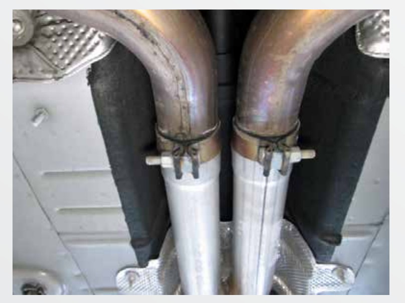
Using 15mm socket disconnect and remove factory head pipes.