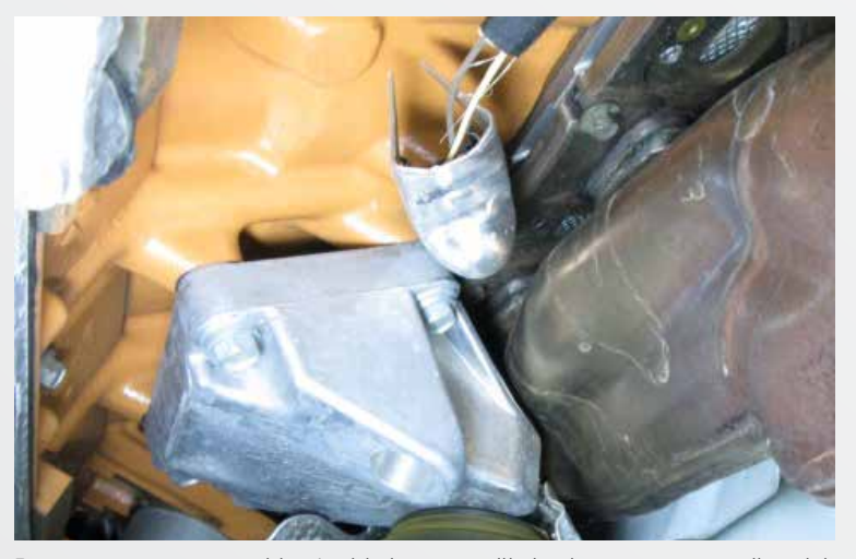
Repeat same steps as driver's side but you will also have to remove dip-stick and remove alternator brace bracket. (Note: you will be re-using dipstick bolt and nut for install).